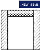
#10 - CHAIR 35"W x 38"D