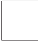
#00F - OTTOMAN 36"W x 36"D