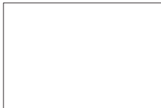
#00F - OTTOMAN 60"W x 40"D