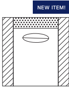
#10 - CHAIR 39"W x 42"D Includes 1 - 18" x 22" lumbar pillow