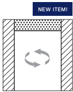
#11 - SWIVEL CHAIR 36"W x 38"D