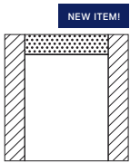
#10 - CHAIR 36"W x 38"D