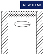
#10 - CHAIR 39"W x 42"D Includes 1 - 18" x 22" throw pillow