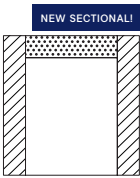
#10 - CHAIR 33"W x 37"D