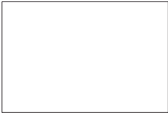
#00F - OTTOMAN 60"W x 40"D